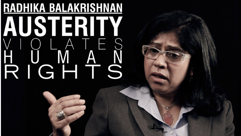
Radhika Balakrishnan interviewed by Laura Flanders, Grit TV, on Austerity: A Violation of Human Rights? , New York, NY, November 20, 2012. Image captured from http://www.thenation.com/blog/171364/austerity-violation-human-rights# .

CWGL substantively contributes to the development and dissemination of a gender perspective of economic and social rights with a focus on macroeconomics. The Economic and Social Rights program is directed in three areas: academic research and dissemination; United Nations policy engagement; and enhancing the capacity of organizations and grassroots activists to apply an economic justice and social rights framework in their advocacy and social change endeavors.