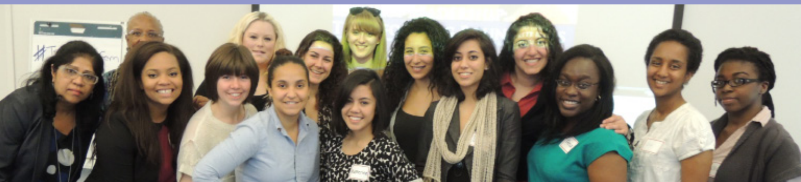
Women's Rights and Policy Making through the United Nations course participants at Feminist Leadership: Transforming Boundaries student report back event, New Brunswick, NJ, April 24, 2013.