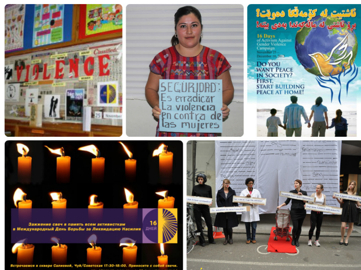
Images from 2012 16 Days Campaign (from left to right): Bishkek Feminist Collective, Kyrgyzstan; cfd, The Feminist Peace Organization, Switzerland; Maitland Library, South Africa ; START Social Development Organization, Iraq; Tlachinollan: Centro de Derechos Humanos de la Montaña, Mexico.